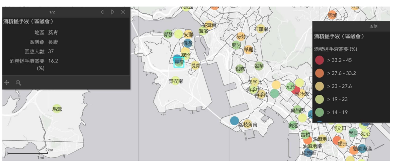
# The CHIS map is temporally available in Chinese only, the English version is under construction.