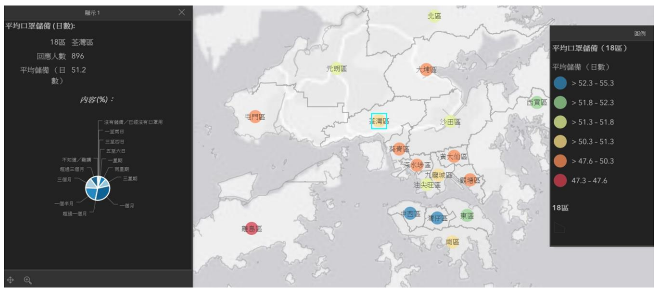
# The CHIS map is temporally available in Chinese only, the English version is under construction.